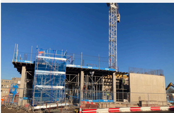
Building progress picture

Construction of a new four-storey building is well underway at the front of the Royal Shrewsbury Hospital (RSH) site. The new facilities will provide the much-needed modern facilities and clinical space needed to improve care for everyone.