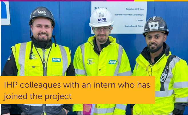
IHP colleagues with an intern who has joined the project

Our contractors, Integrated Health Projects (IHP), are committed to bringing social value to local communities and businesses across Shropshire, Telford and Wrekin and mid Wales.