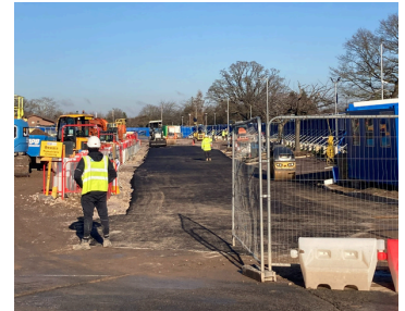
New road within the construction site

Together, with IHP, we have been working hard to improve the road conditions recognising that in adverse weather there has been an increased amount of mud left by traffic. We now have a wheel washer installed at the north end of the construction site, which cleans all construction vehicle wheels before they leave. We are also in the process of tarmacking a strip of road within the construction site to help keep construction vehicles clean. We have two road sweepers in operation, which are also helping to keep the roads as clean as possible.