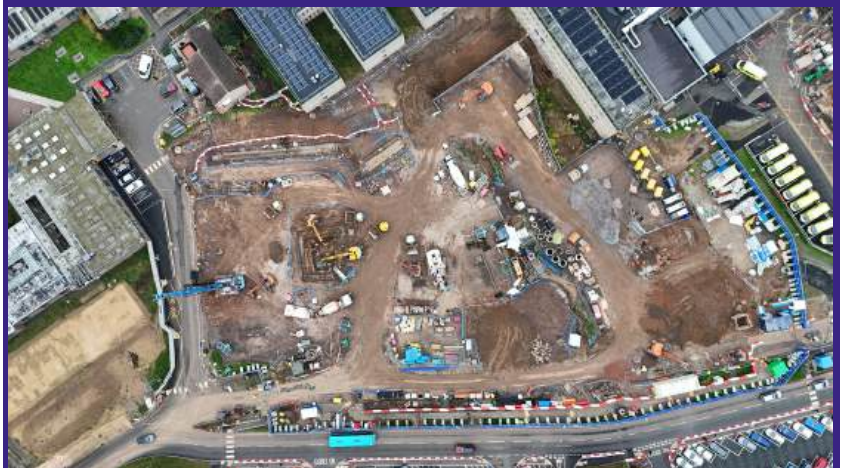
Aerial footage of the construction works