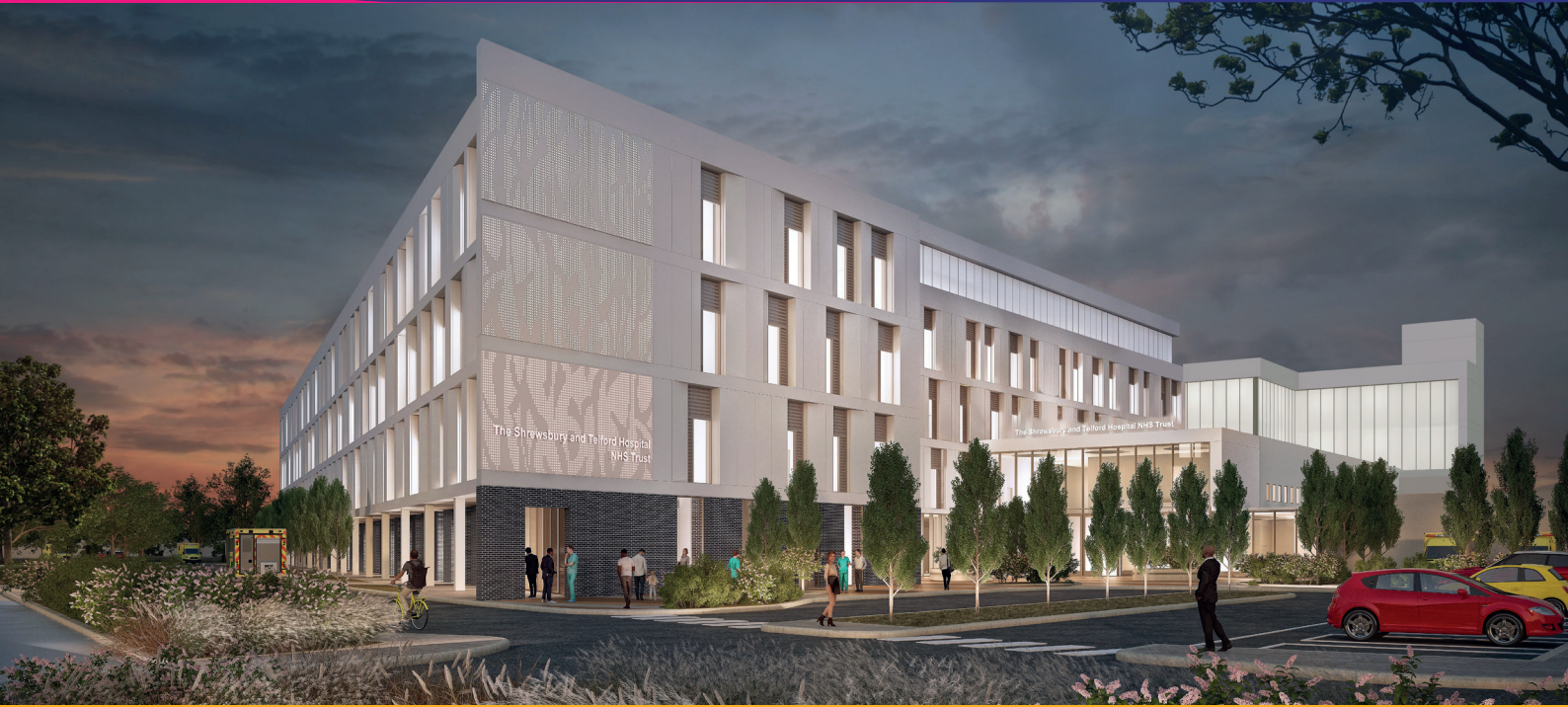
Computer generated image of the new facilities at the Royal Shrewsbury Hospital site

A community update on works at Royal Shrewsbury Hospital as part of the Hospitals Transformation Programme