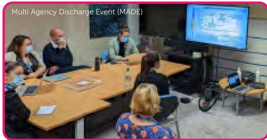
Multi Agency Discharge Event (MADE)

Investment in new technology and continuous need for investment has been possible through our clinical networking and also provides opportunities for research and development as well as offering improved career pathways with new roles.