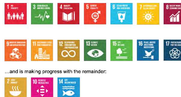
...and is making progress with the remainder:

This Trust has been a “Good Corporate Citizen” for 12 years. SaTH is contributing to 14 of the 17 UN Sustainability Goals: